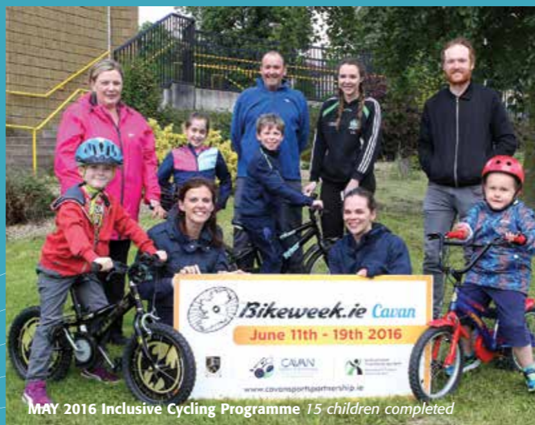
MAY 2016 Inclusive Cycling Programme 15 children completed

"I just wanted to let you know this program is the best thing I've ever enrolled my sons in" (Parent)