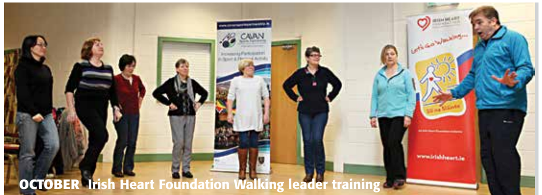
OCTOBER Irish Heart Foundation Walking leader training