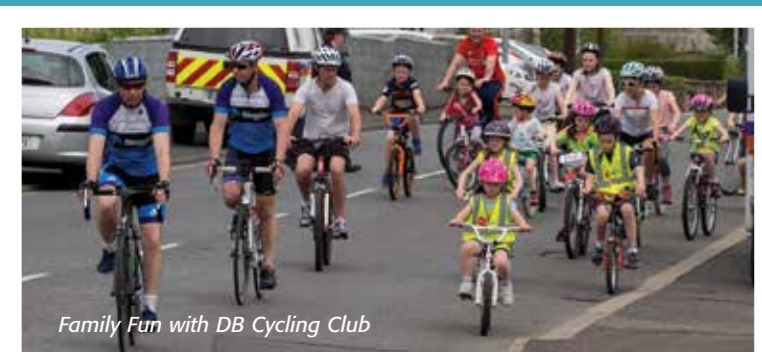
Family Fun with DB Cycling Club