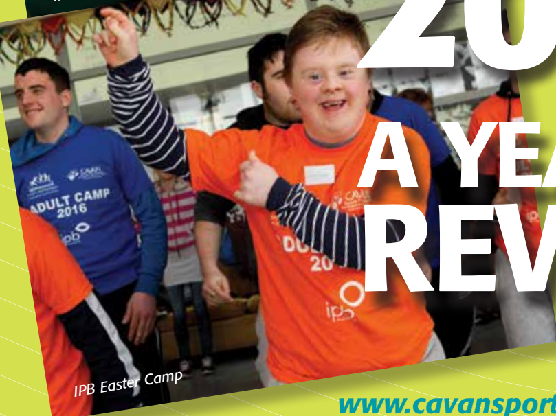
IPB Easter Camp