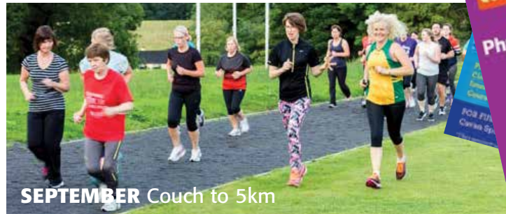
SEPTEMBER Couch to 5km

Register online; www.cavansportspartnership.ie