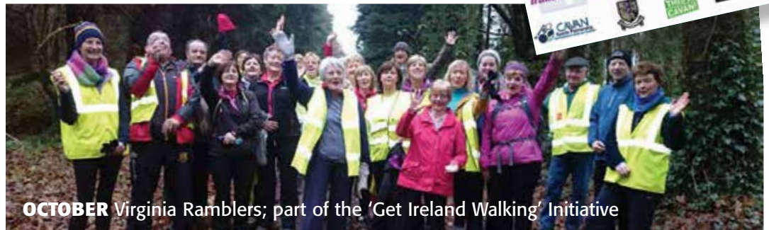
OCTOBER Virginia Ramblers; part of the 'Get Ireland Walking' Initiative