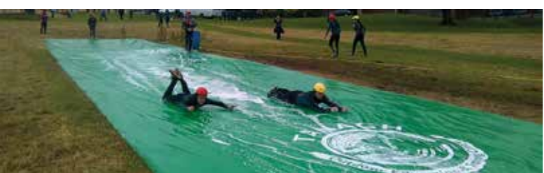
SIDO Disability. IPB Summer Camp