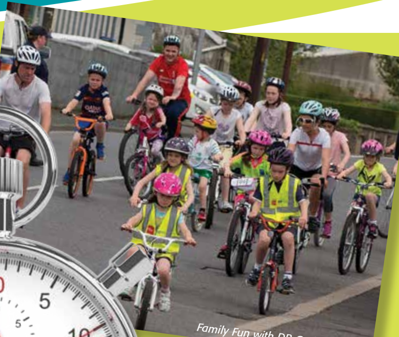
Family Fun with DB Cycling Club