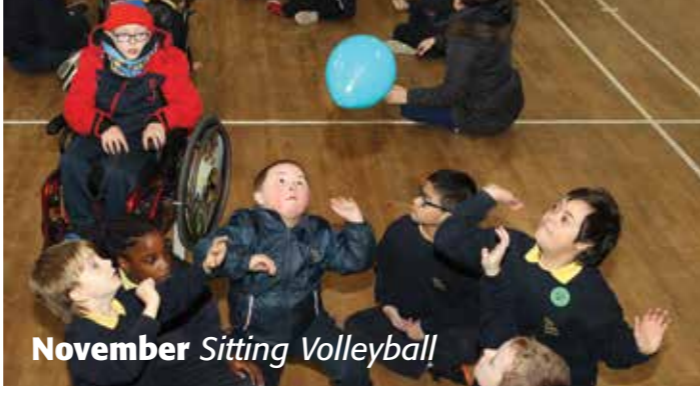
November Sitting Volleyball

March First Disability in Sport workshop delivered in Cavan in March this year. 47 people have completed the course in 2016