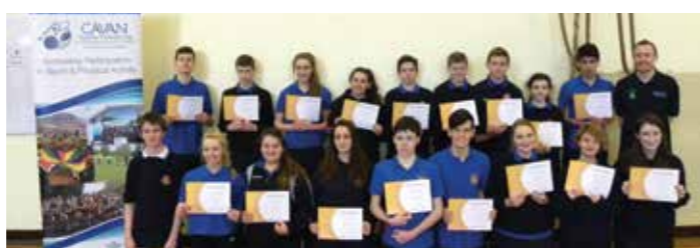
SEPTEMBER Transition year students from Bailieborough Community