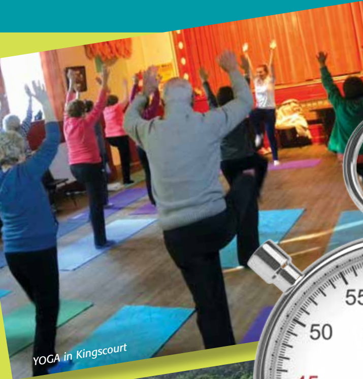
YOGA in Kingscourt