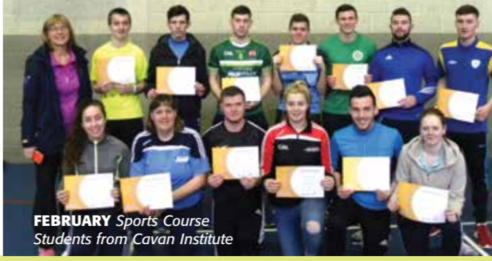
FEBRUARY Sports Course Students from Cavan Institute