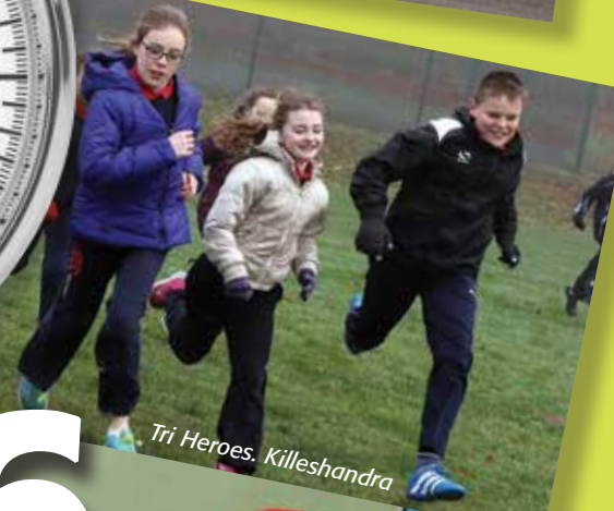
Tri Heroes. Killeshandra