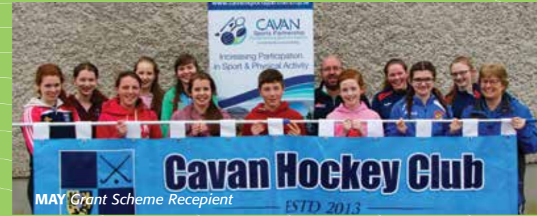
MAY Grant Scheme Recipient

Clubs and community groups received €6,560 in 2016 for local sporting activities and initiatives.