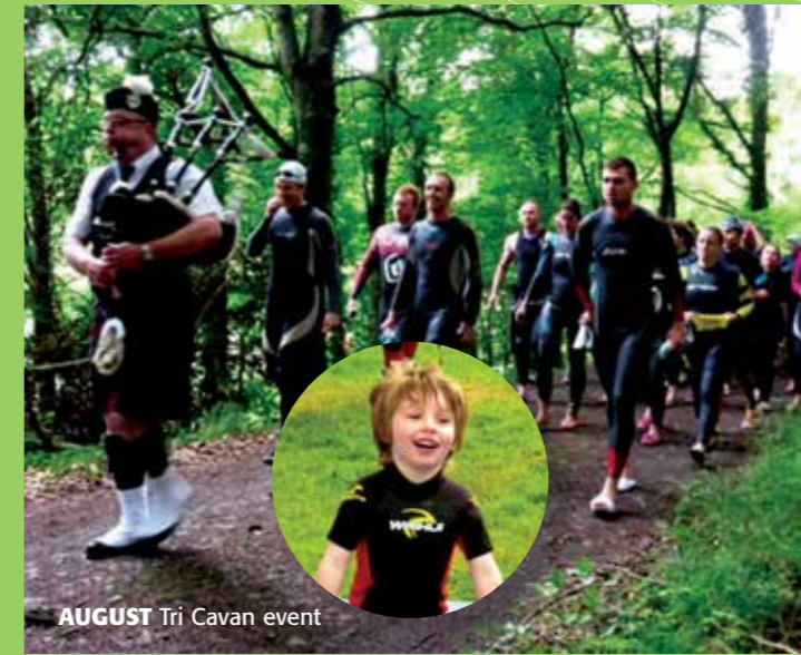
AUGUST Tri Cavan event